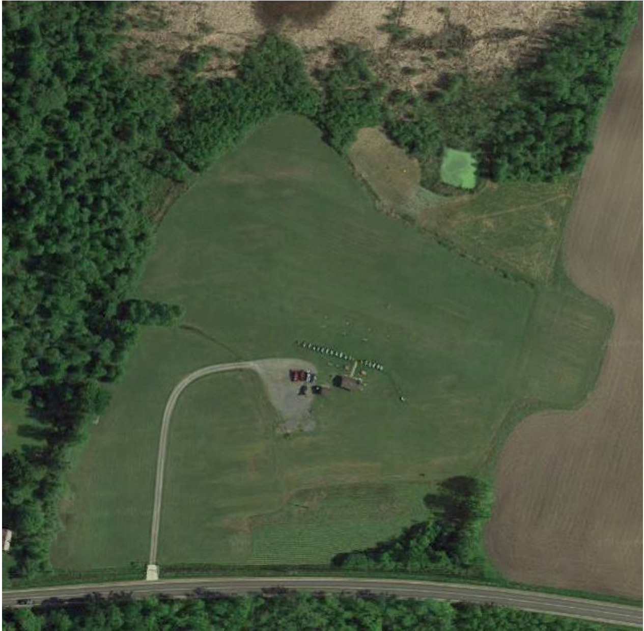
STARS Field Satellite photo

A satellite photo with the new shed is still not available!